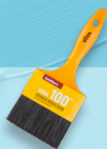
Hamilton's Viva 100mm brush